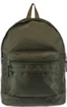
OLIVE / 020-3000