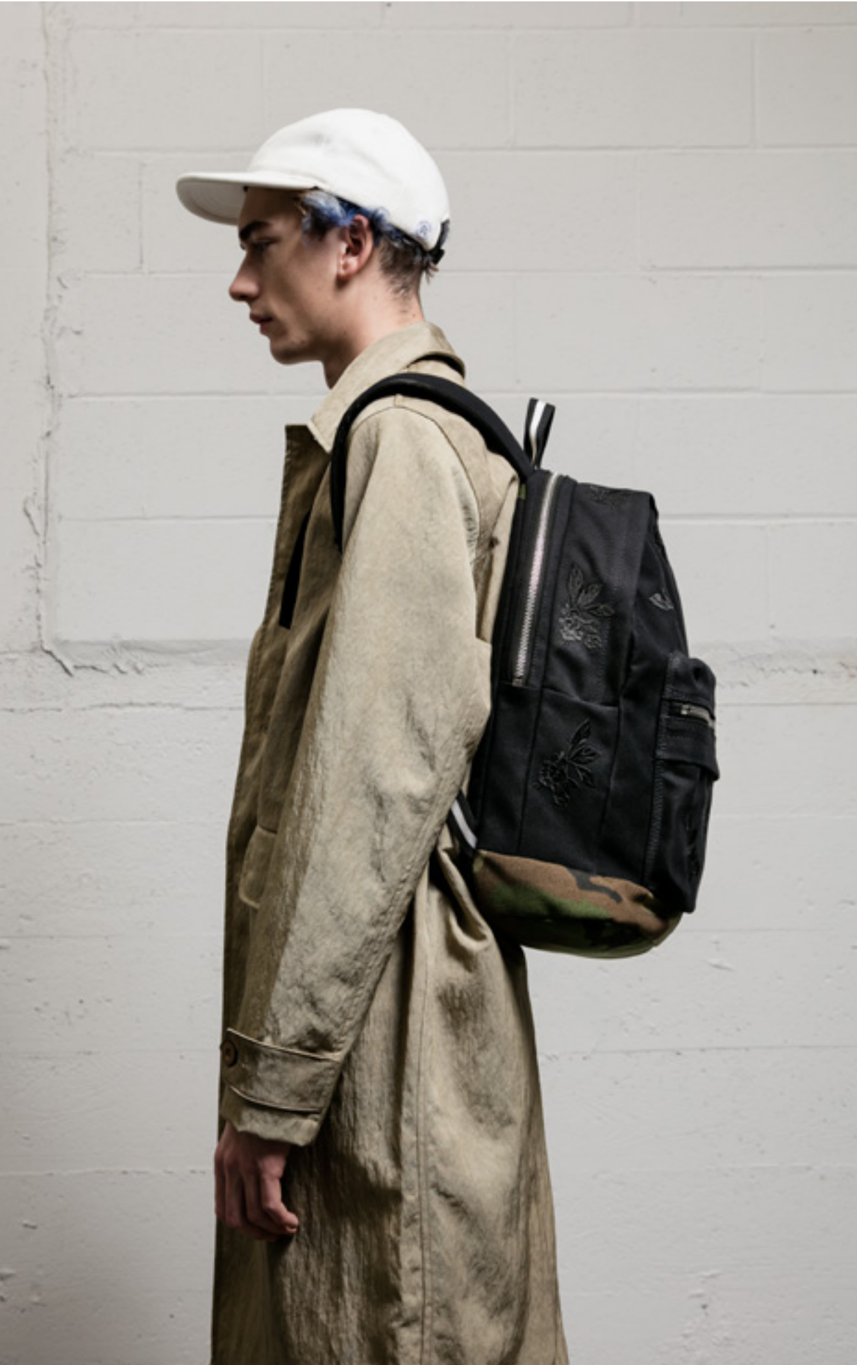
LANCER IN EMBROIDERED BLACK / CORDURA™ CAMOUFLAGE 120-2000