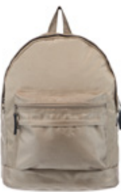
KHAKI / 020-5000