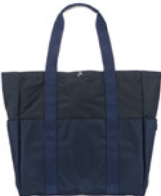
NAVY / 030-2000