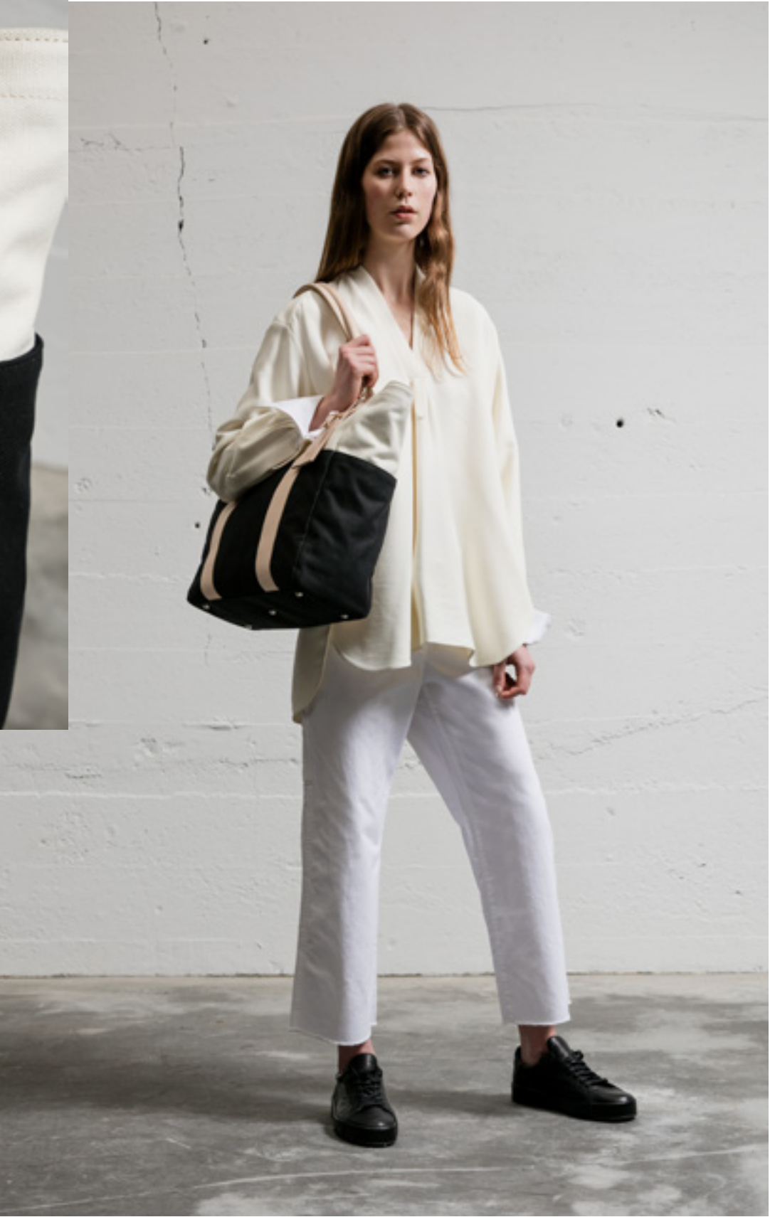
SHERPA IN BLACK / OFF WHITE / ITALIAN VEG TAN LEATHER