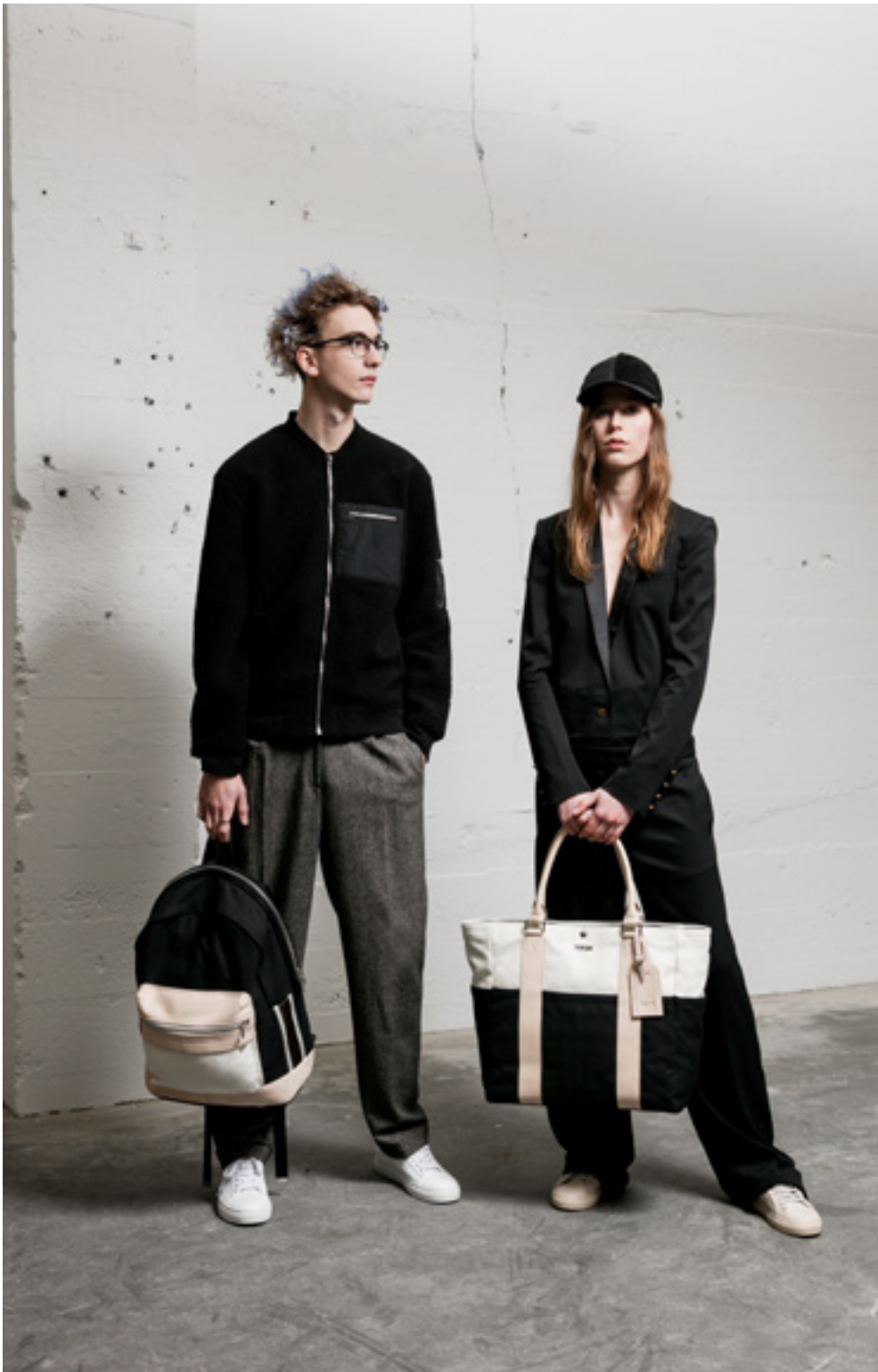
LANGER IN BLACK / OFF WHITE / ITALIAN VEG TAN LEATHER