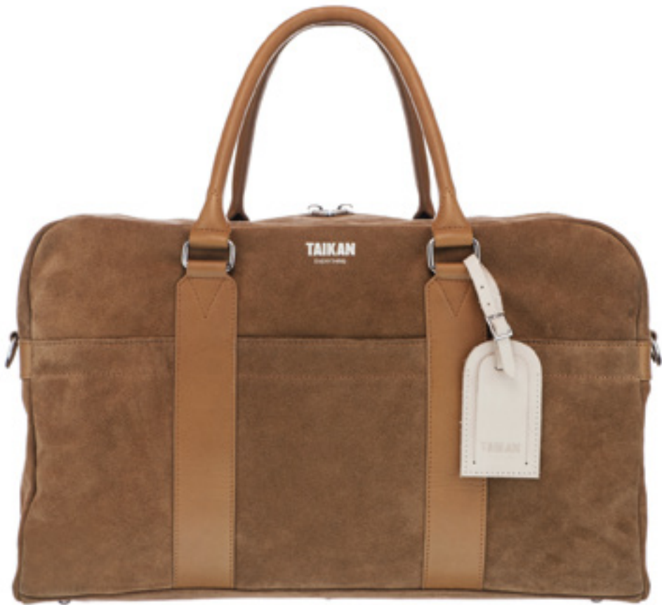
PROWLER TOBACCO SUEDE

Italian Suede and Leather Italian Veg Tan Leather Luggage Tag Cotton Twill Lining 2 Front and Back Slip Pockets Removable and Adjustable Leather And Nylon Shoulder Strap Large Interior Zip Pocket SKU 150-2000 H 11.5in W 19.5in D 8.5in