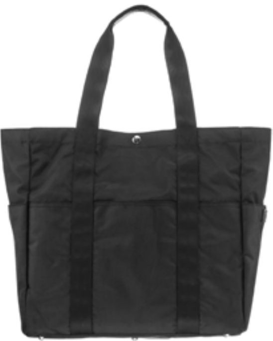
BLACK / 030-1000