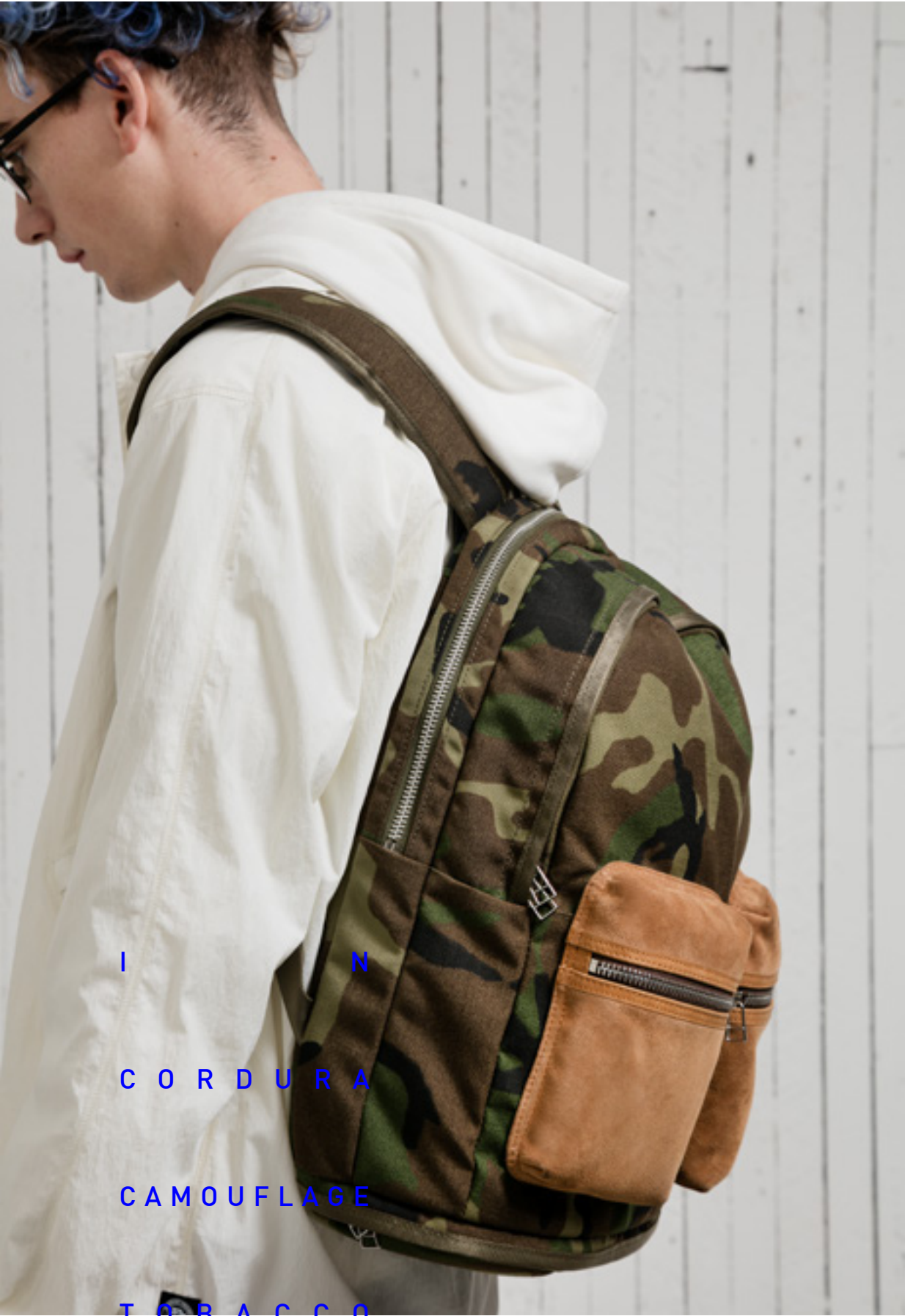
SPARTAN IN CORDURA™ CAMOUFLAGE / TOBACCO SUEDE 160-2000

I N C O R D U R A C A M O U F L A G E T O B A C C O S U E D E