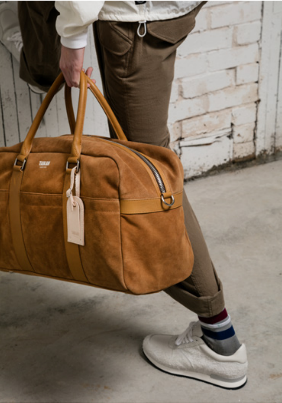
PROWLER IN TOBACCO SUEDE 150-2000