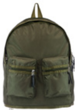
OLIVE / 060-3000