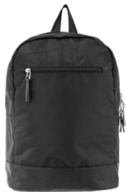
BLACK / 040-1000