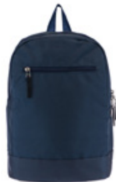
NAVY / 040-2000