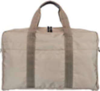
KHAKI / 050-5000