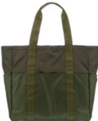
OLIVE / 030-3000