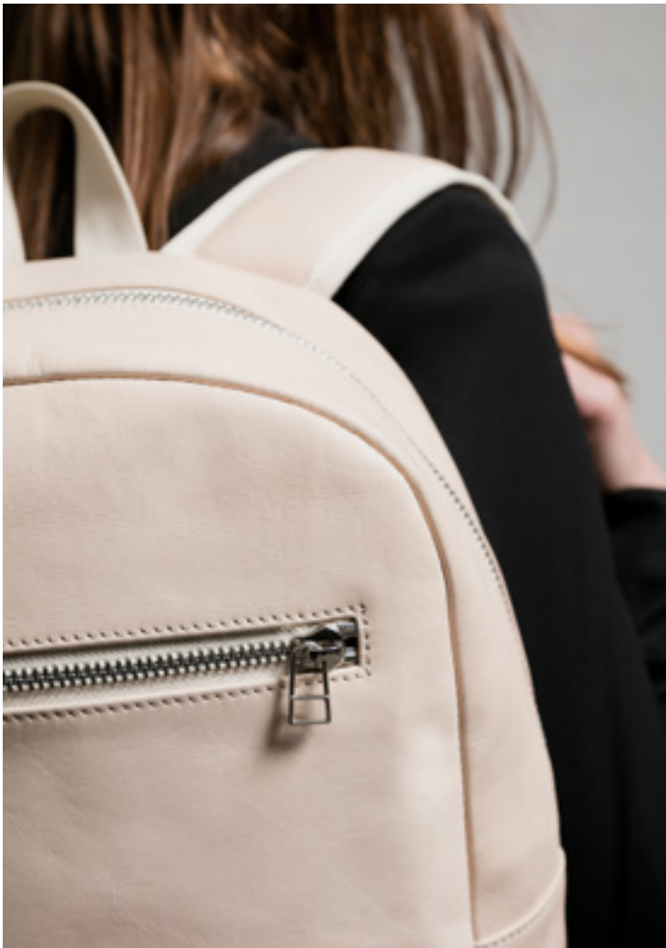
TOMCAT IN ITALIAN VEG TAN LEATHER 140-1000