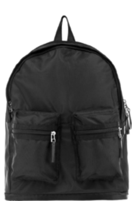
BLACK / 060-1000