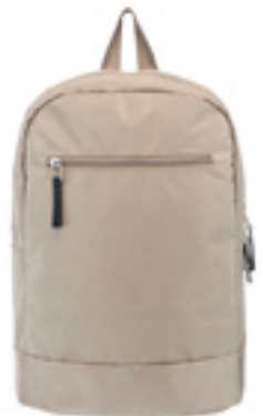
KHAKI / 040-5000