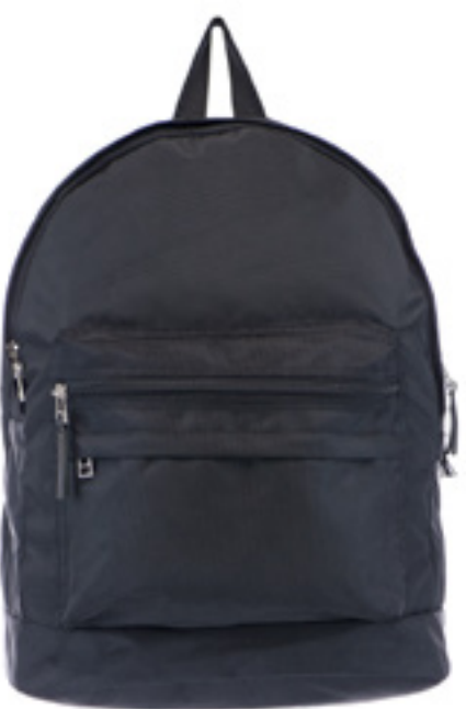
BLACK / 020-1000