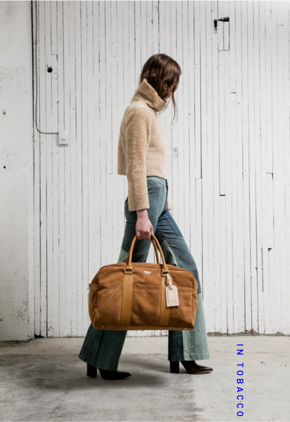
IN TOBACCO SUEDE