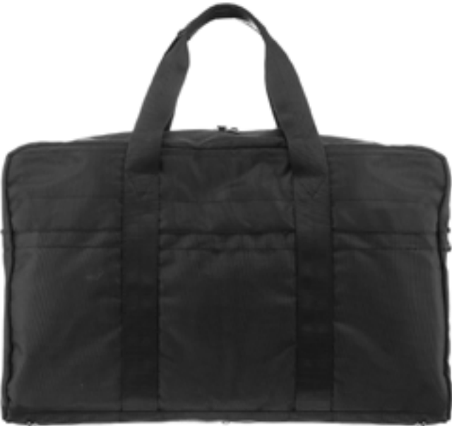
BLACK / 050-1000