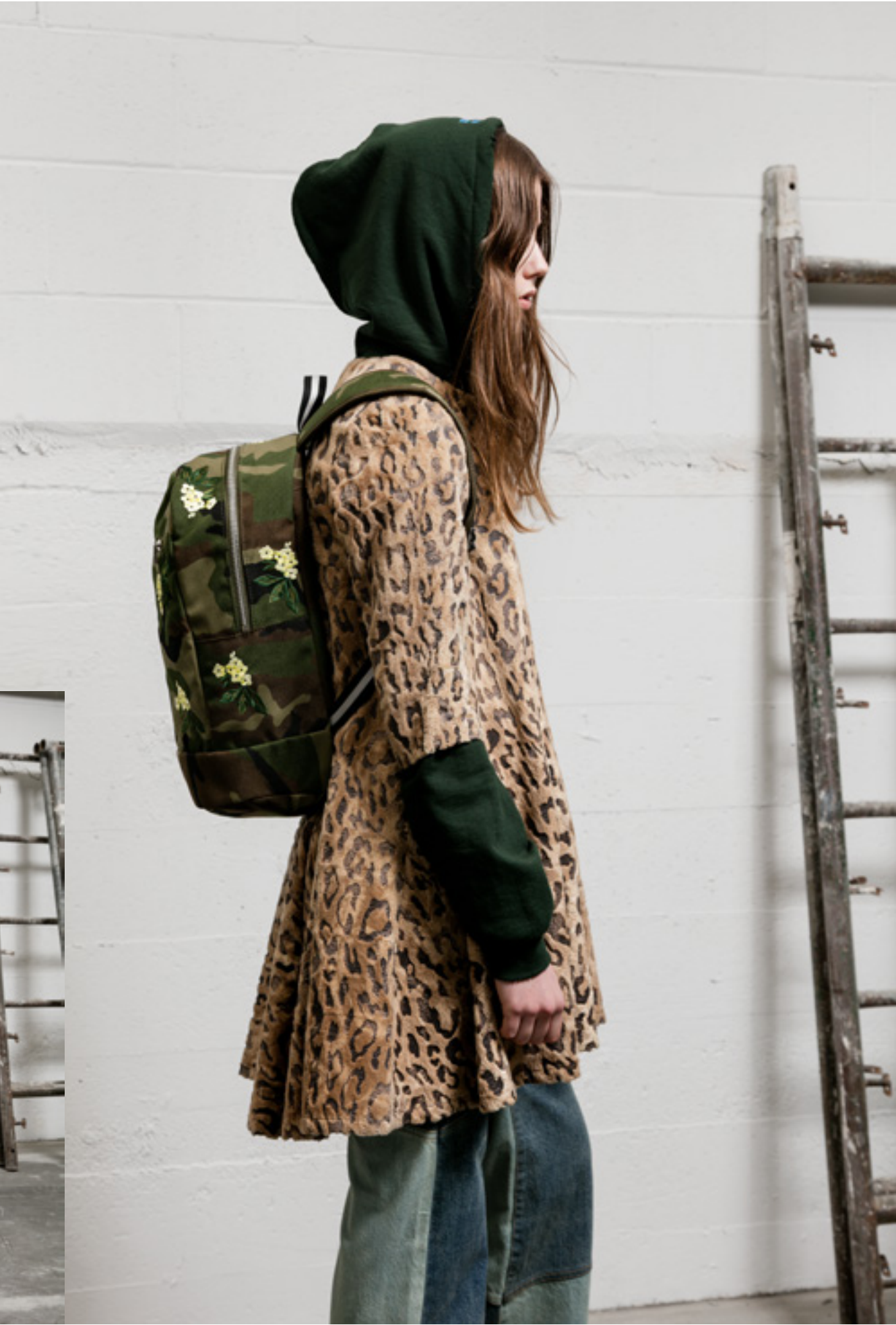
TOMCAT IN EMBROIDERED CORDURA™ CAMOUFLAGE 14.0-20.00