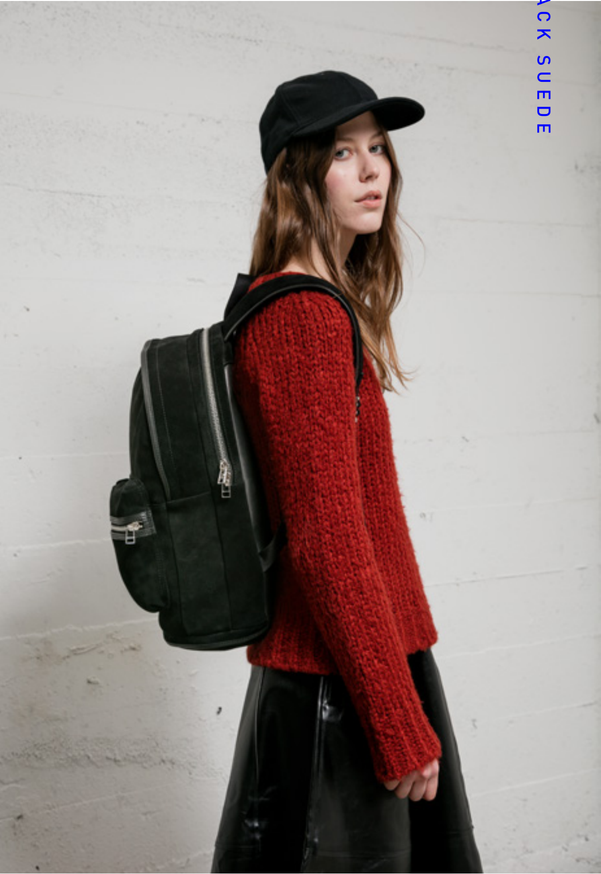
SPARTAN IN BLACK SUEDE 160-3000