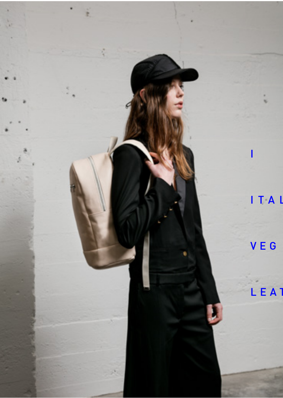
I N I T A L I A N V E G T A N L E A T H E R

TOMCAT is a slim, low profile backpack that is not only unisex, but also caters to those with a petit build. This Premium Italian Veg Tan Leather bag keeps a streamline silhouette by not including a bulky external pouch, ideal for your daily commutes. Additional features include an internal neoprene sleeve that can accommodate up to a 15" laptop, nickel finish YKK zips and hardware, and external zip to easily access small items.