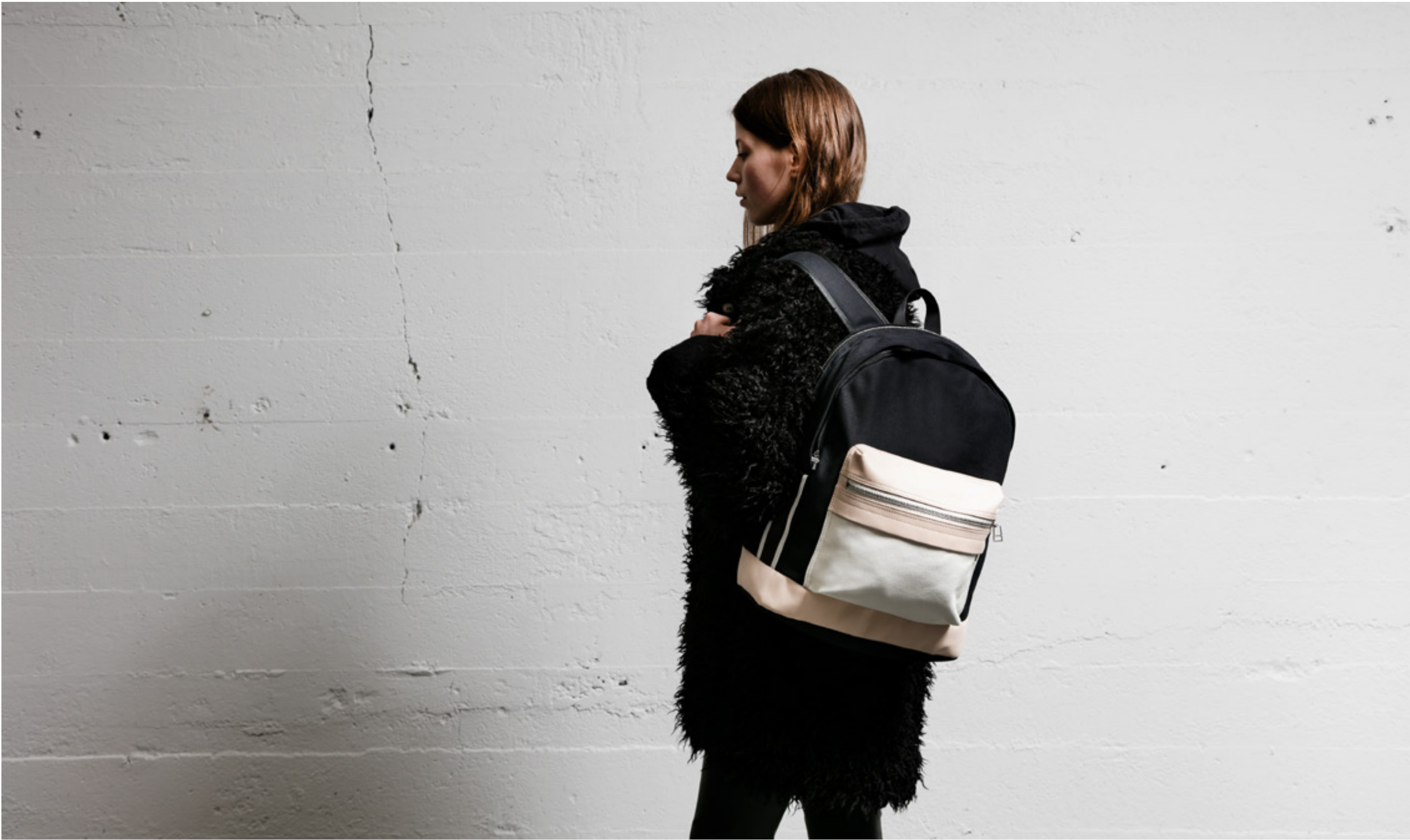
LANCER IN BLACK / OFF WHITE / ITALIAN VEG TAN LEATHER 120-1000