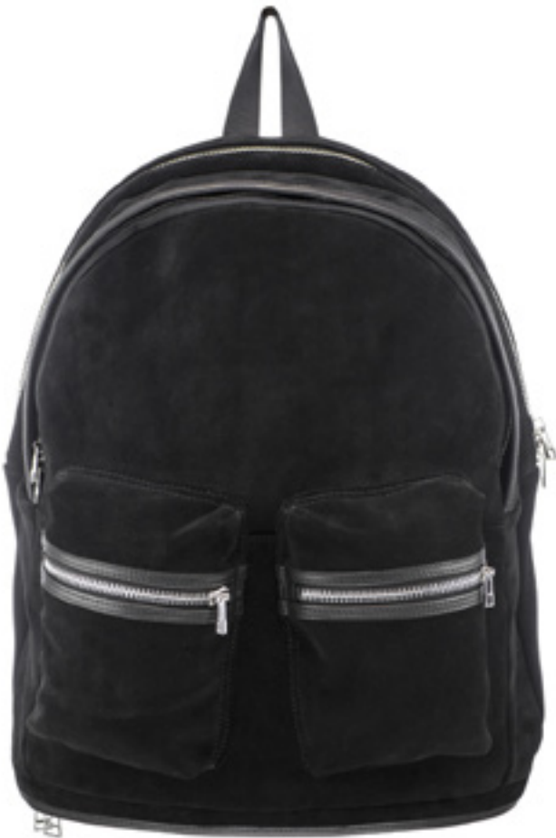
SPARTAN BLACK SUEDE

Italian Suede and Leather Italian Veg Tan Leather Luggage Tag Cotton Twill Lining 2 Front and Back Slip Pockets Removable and Adjustable Leather And Nylon Shoulder Strap Large Interior Zip Pocket SKU 150-2000 H 11.5in W 19.5in D 8.5in