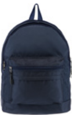
NAVY / 020-2000