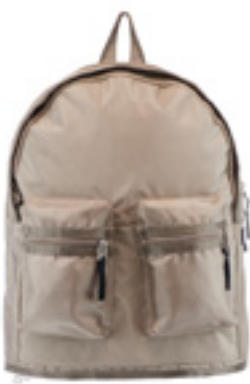
KHAKI / 060-5000