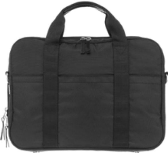
BLACK / 070-1000