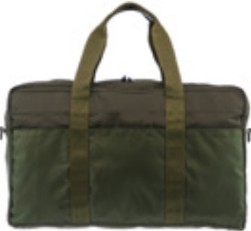
OLIVE / 050-3000