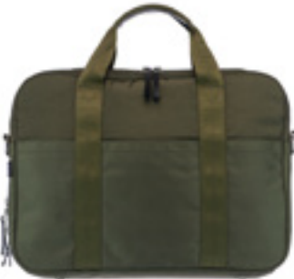
OLIVE / 070-3000