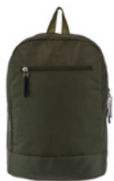
OLIVE / 040-3000