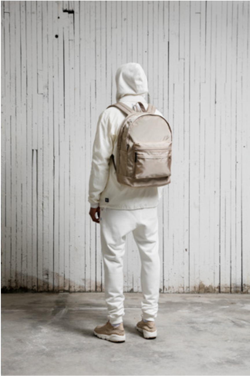
LANCER IN KHAKI 020-5000

AVAILABLE IN BLACK / NAVY / OLIVE / KHAKI