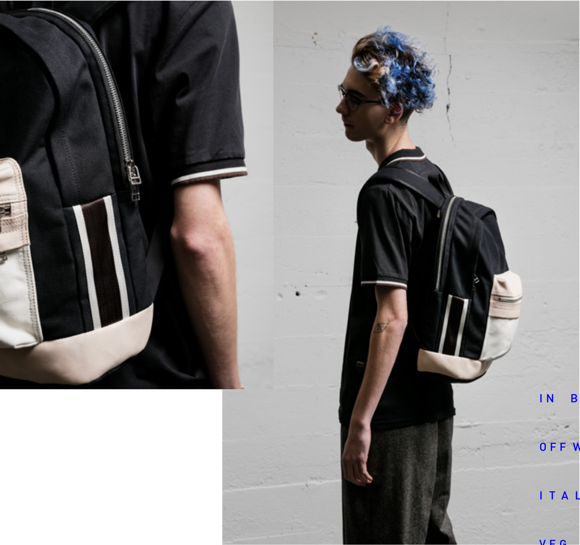
LANCER IN BLACK / OFF WHITE / ITALIAN VEG TAN LEATHER 120-1000

LANCER is an update to the most classic backpack silhouette for a modern lifestyle. This treated Cotton-Canvas and Italian Veg Tan Leather bag features an external 15" laptop compartment for easy CPU access, and dual pocket YKK zips giving multiple solutions for external storage.