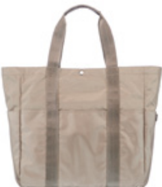
KHAKI / 030-5000